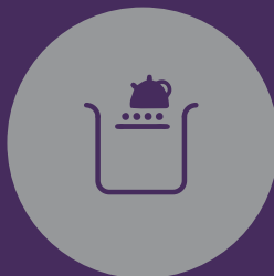
Open Yet Private Kitchen