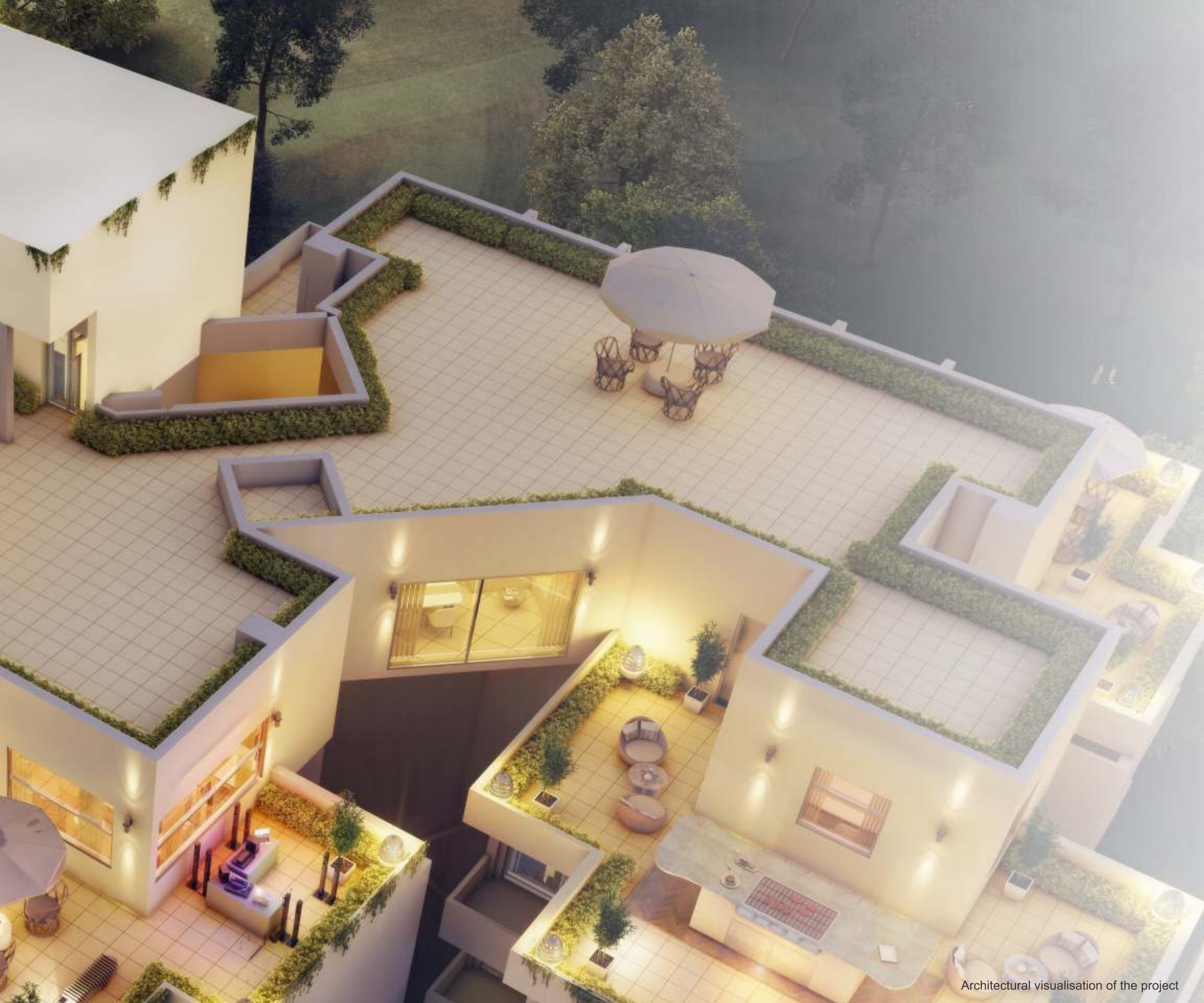
Architectural visualisation of the project