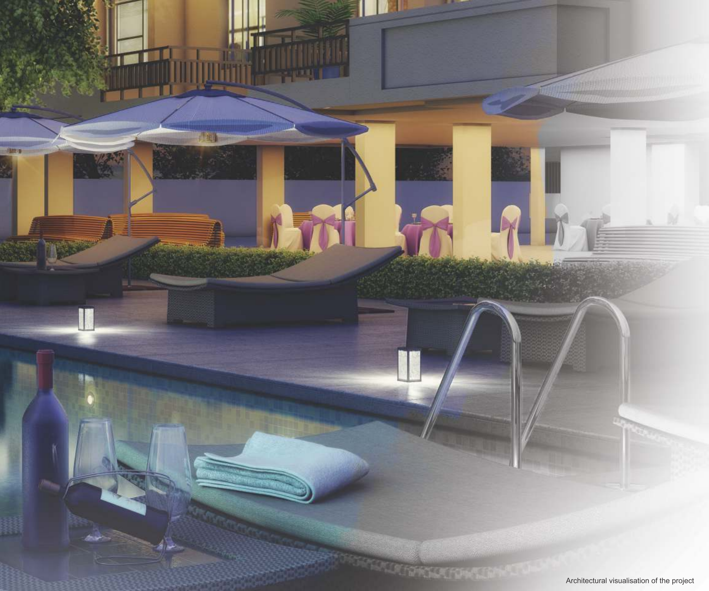
Architectural visualisation of the project