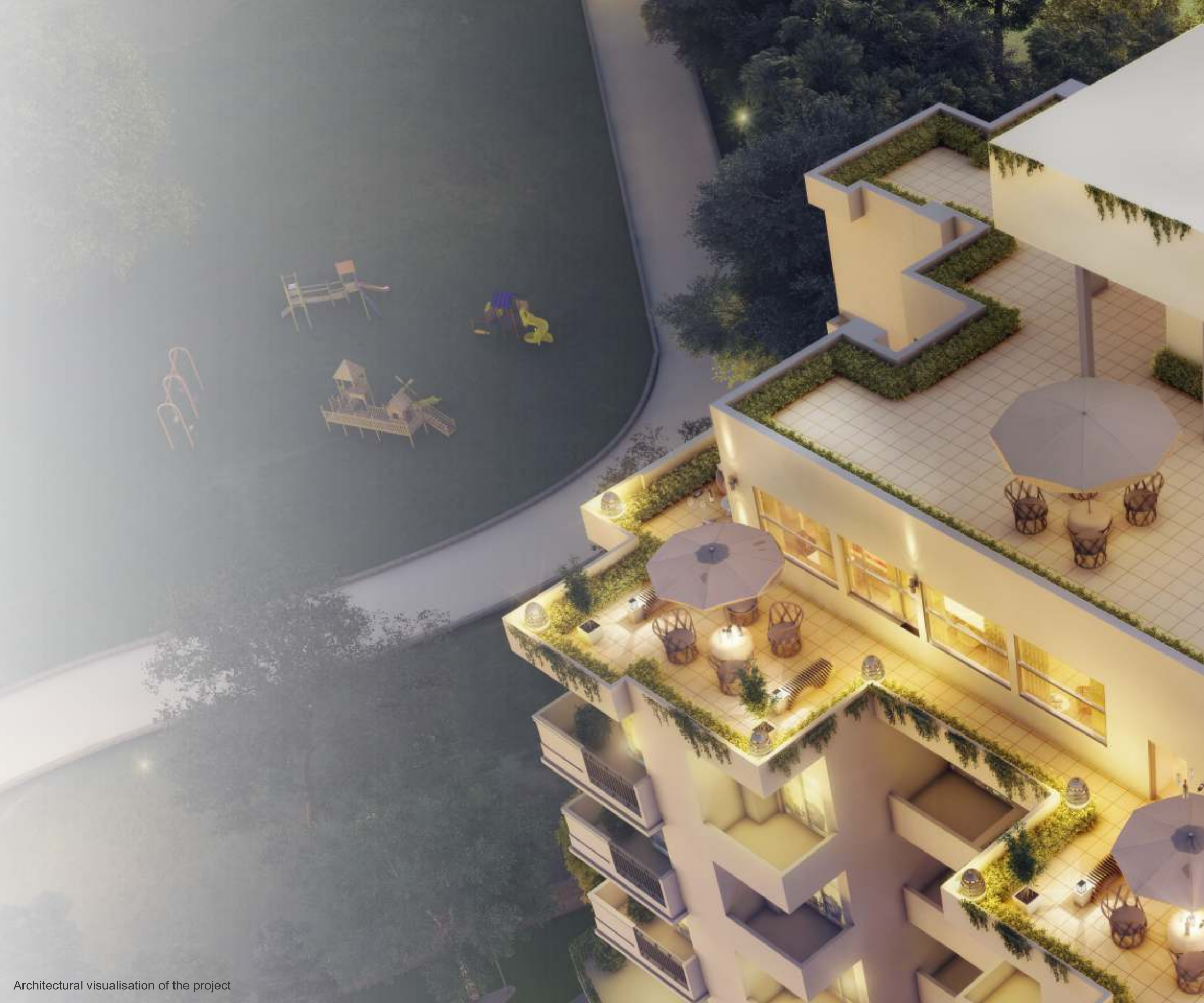
Architectural visualisation of the project