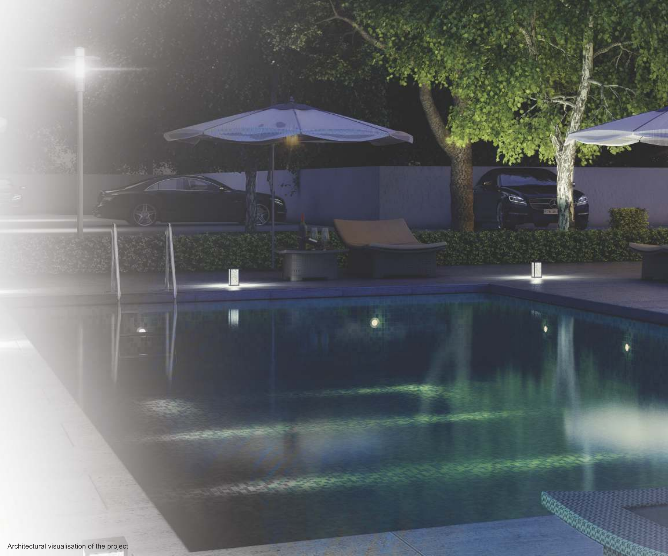
Architectural visualisation of the project