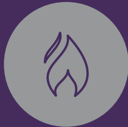
Piped Gas Supply