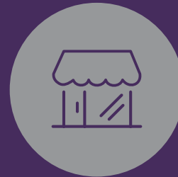
Convenience Shops Within The Complex