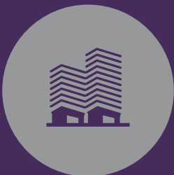
Independent Towers For Ventilated And Healthy Living