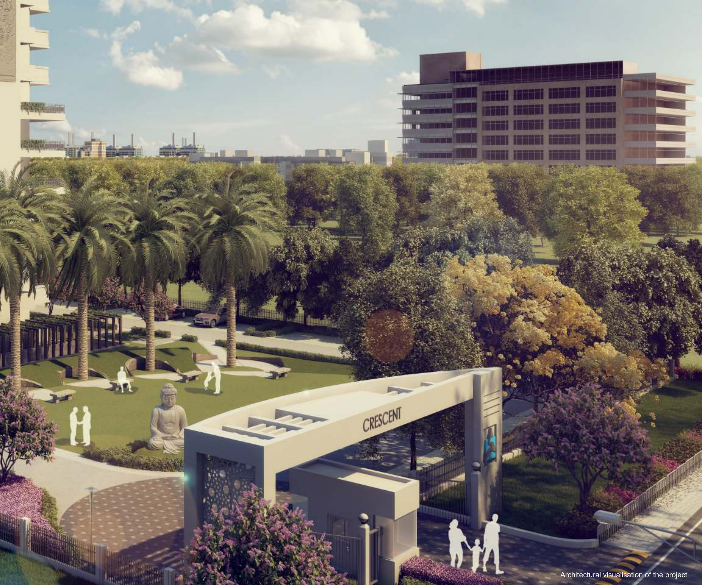
Architectural visualisation of the project