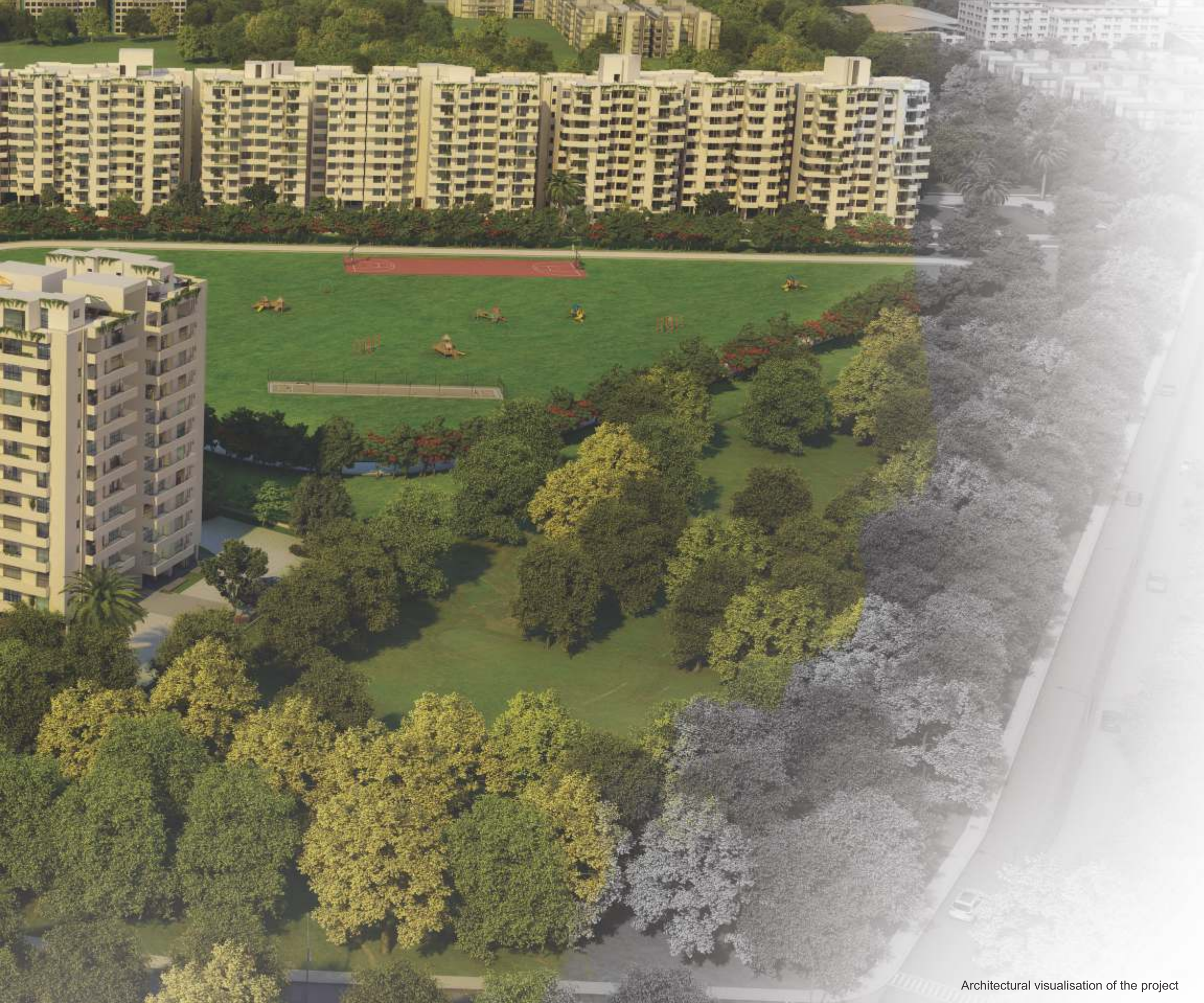
Architectural visualisation of the project