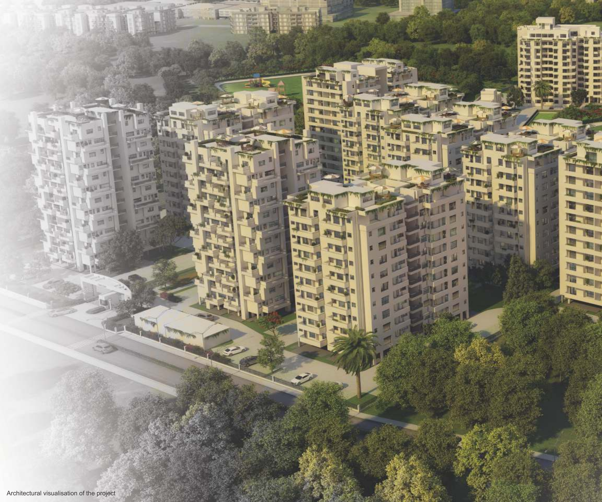
Architectural visualisation of the project