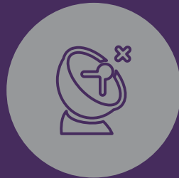
DTH- & Broadband- Ready Homes