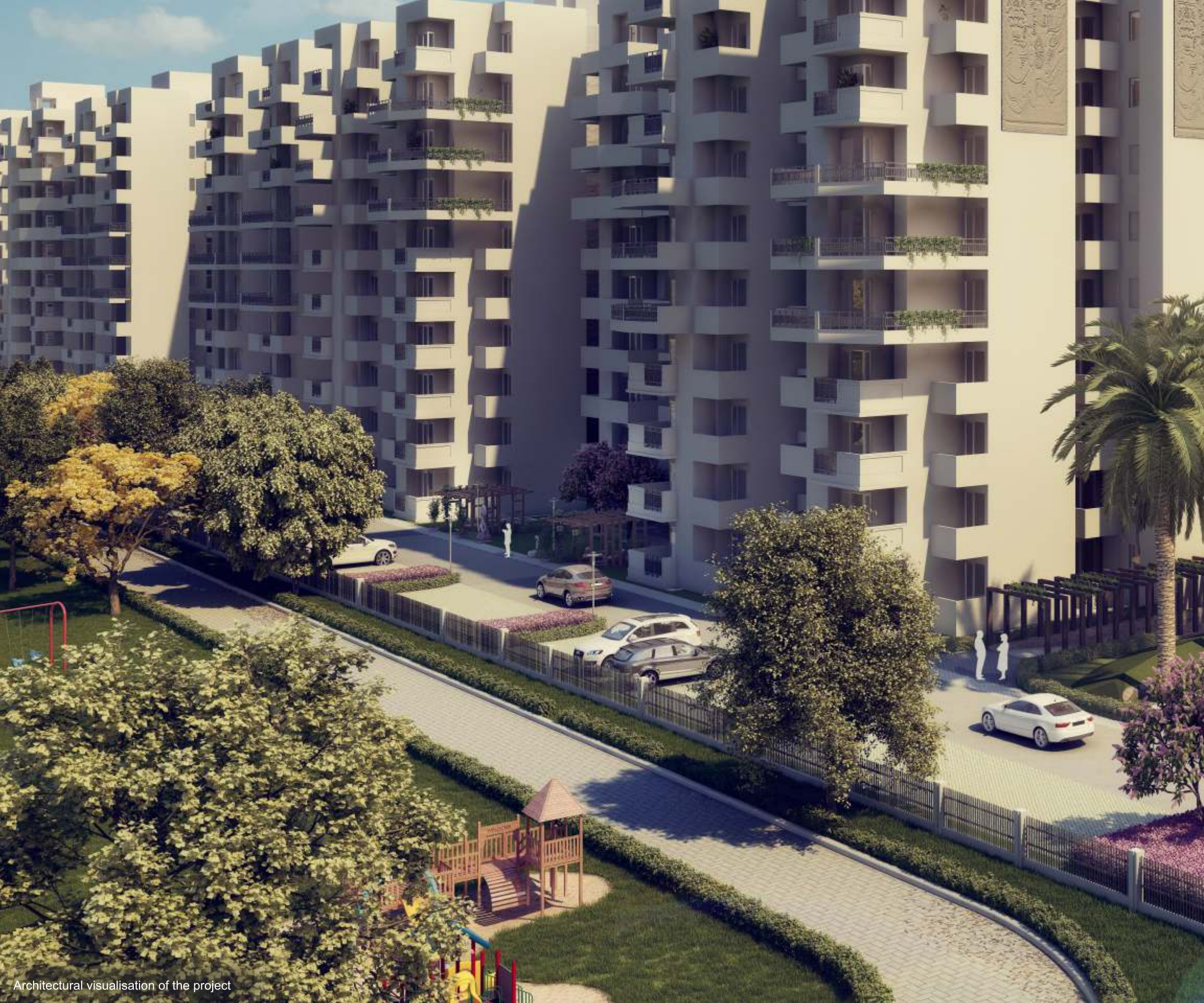
Architectural visualisation of the project