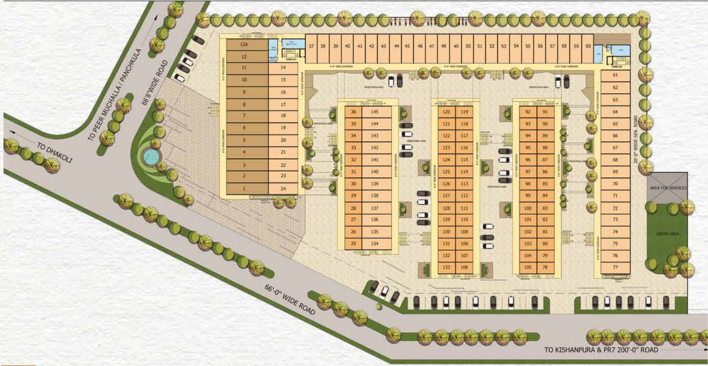
Upper Ground Floor Plan