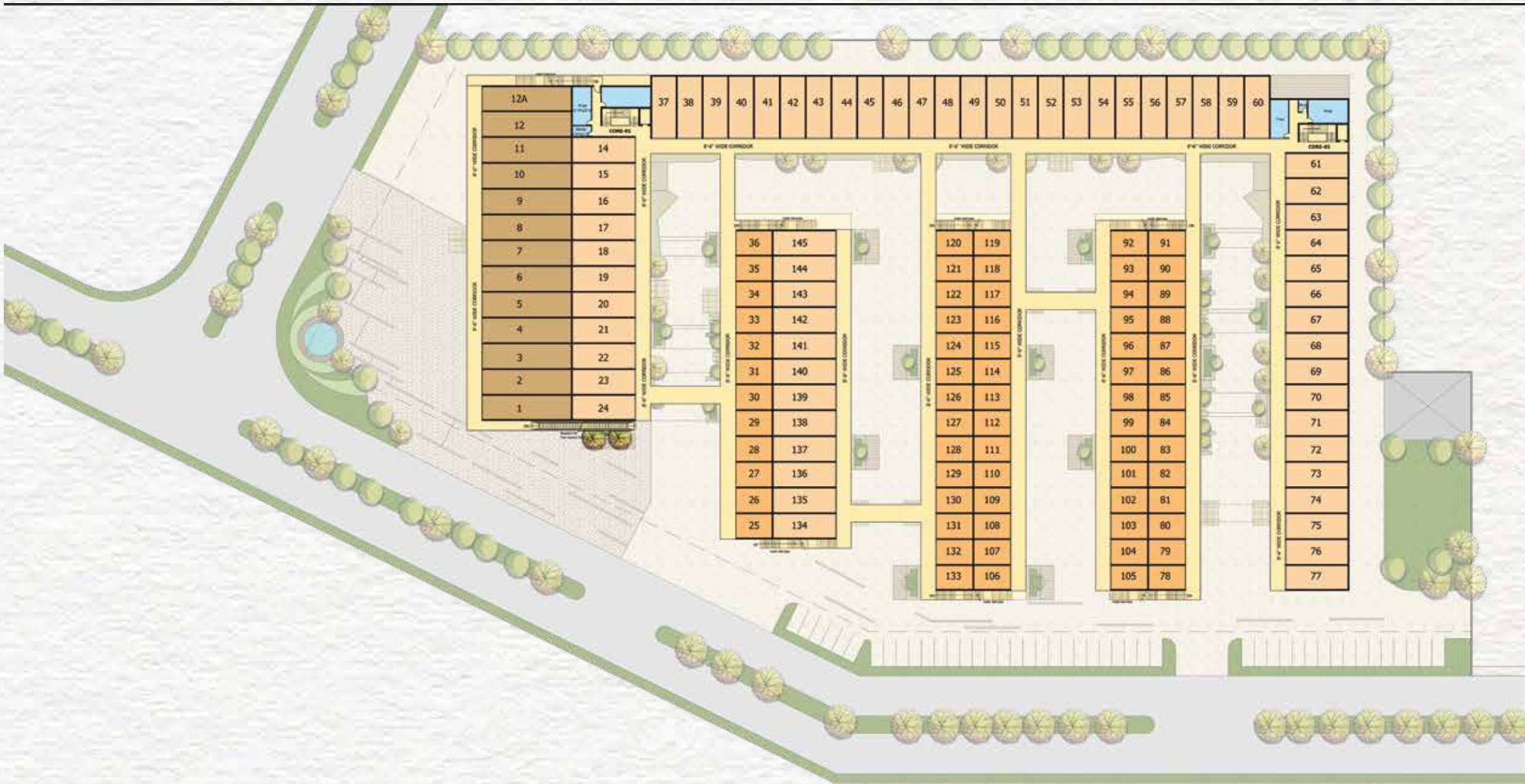
First Ground Floor Plan