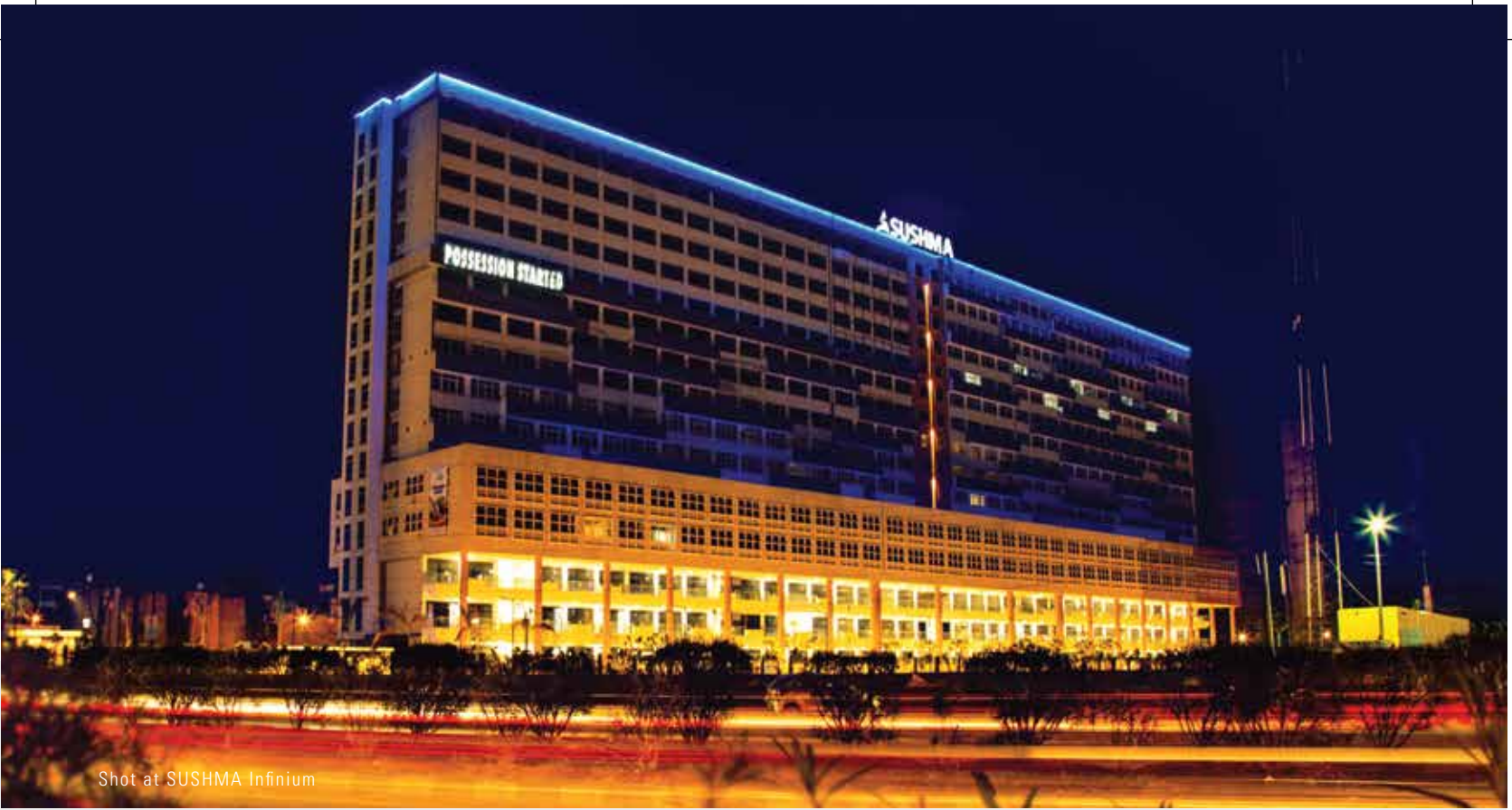
Shot at SUSHMA Infinium